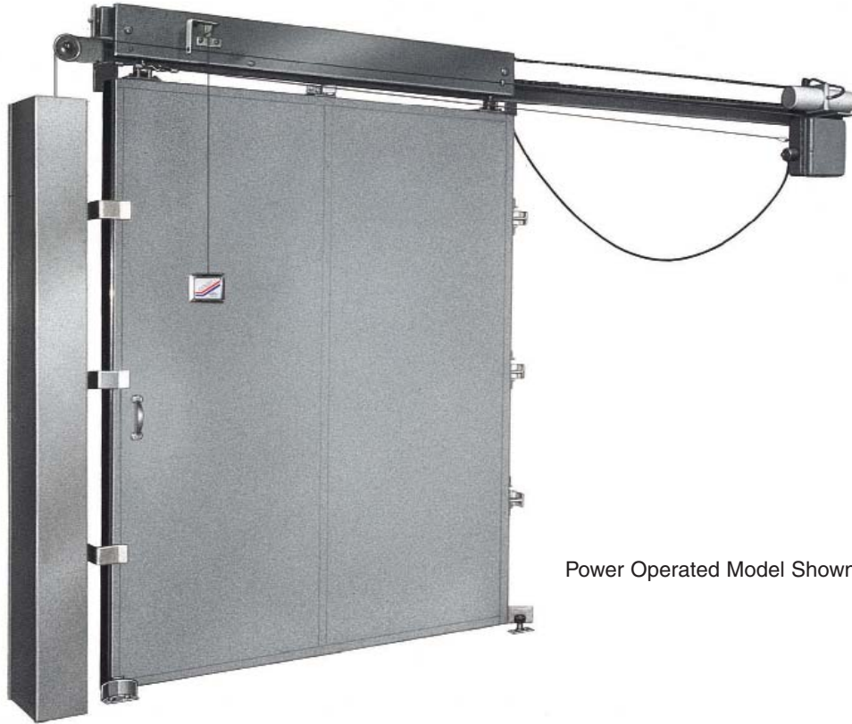
Power Operated Model Shown