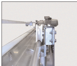
STANDARD XP SERIES HEADER AND RAIL ASSEMBLY