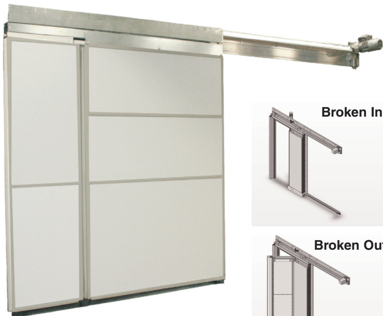
Power Model shown.

Designed for high cycle operation, every aspect of the IXP door was engineered to eliminate maintenance and downtime. The entire door system requires no lubrication and has no metal-to-metal contact eliminating wearing surfaces. The door's complete gasket release travel design, no wood construction, simple quick connect heat, and one-piece gasket system, virtually eliminates maintenance.