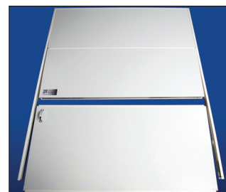
OPTIONAL REPLACEABLE BOTTOM PANEL SECTIONS