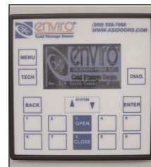
DIGITAL DISPLAY WITH SELF-DIAGNOSTICS