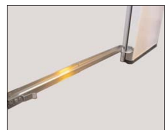
OPTIONAL BREAKAWAY WALL TRACK