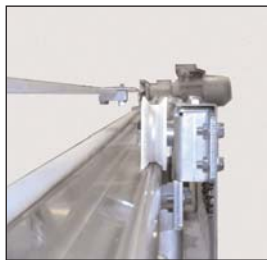
STANDARD XP SERIES HEADER AND RAIL ASSEMBLY