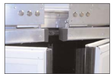
OPTIONAL BREAKAWAY PANEL