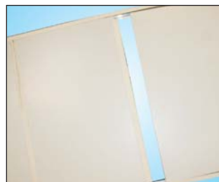
REPLACEABLE BOTTOM PANEL SECTIONS