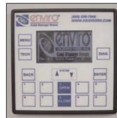
DIGITAL DISPLAY WITH SELF-DIAGNOSTICS