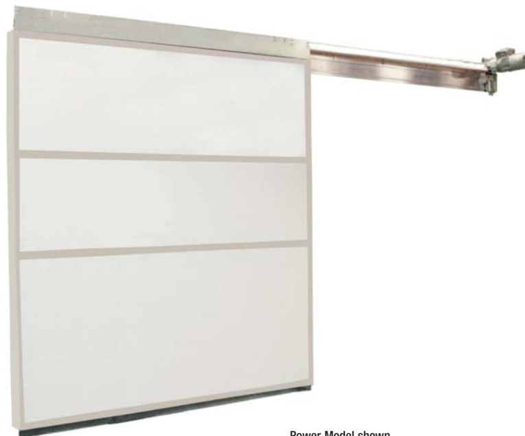
Power Model shown.

Designed for high cycle operation, every aspect of the XP door was engineered to eliminate maintenance and downtime. The entire door system requires no lubrication and has no metal-to-metal contact eliminating wearing surfaces. The door's complete gasket release travel design, no wood construction, simple quick connect heat, and one-piece gasket system, virtually eliminates maintenance.