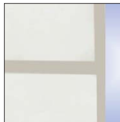
FULL PERIMETER REPLACEABLE CAPPING WITH INTEGRATED GASKET SEALS